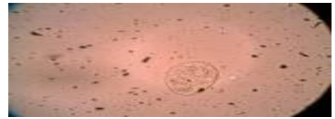
New Biology Mascot: Bob the Blob