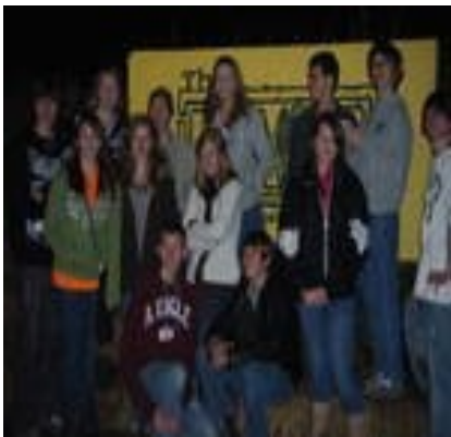
Corn Maze Gang

them, and strange beings hid in the corn waiting for a chance to attack. Everyone made it out alive, and though it was extremely muddy, we had a great time. The group topped off the night with Cici's pizza.